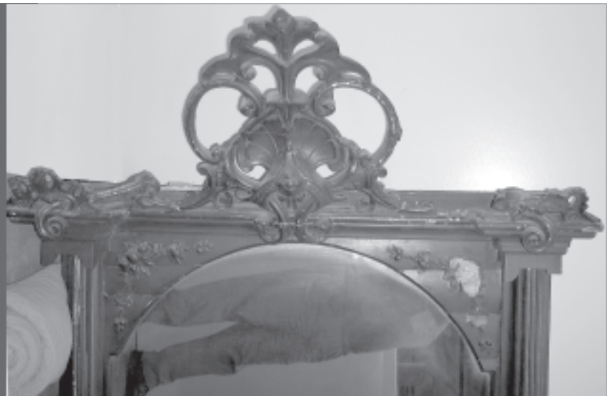
(above left) The pier mirror as it stood in the Campbell House front entry hall in about 1885. (above and left) The entry pier mirror awaiting restoration in storage.