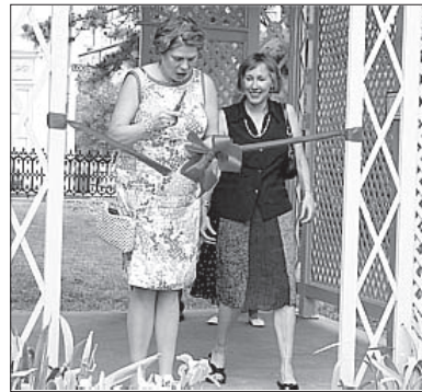
(below) Cutting the ribbon.