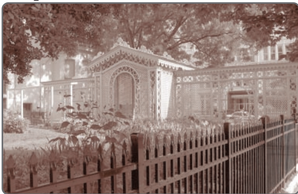
The restored garden gazebo and the new 15th Street fence.

T he Museum's restored garden gazebo was dedicated at the annual Spring members party on June 10, marking the end of major building restoration projects at Campbell House.