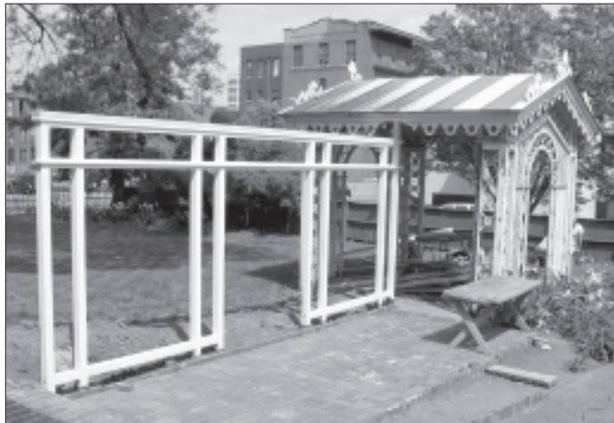
(above) The west wing of the gazebo during restoration.