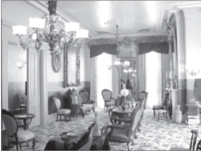
Restored Campbell Parlor.