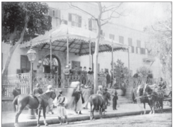
(right bottom) SHEPHEARD'S HOTEL, CAIRO, EGYPT, 1884. Hugh Campbell labeled this photo in his travel album—"This is the Shepherd's Hotel where Jimmie and I are but our rooms look out on the garden side."