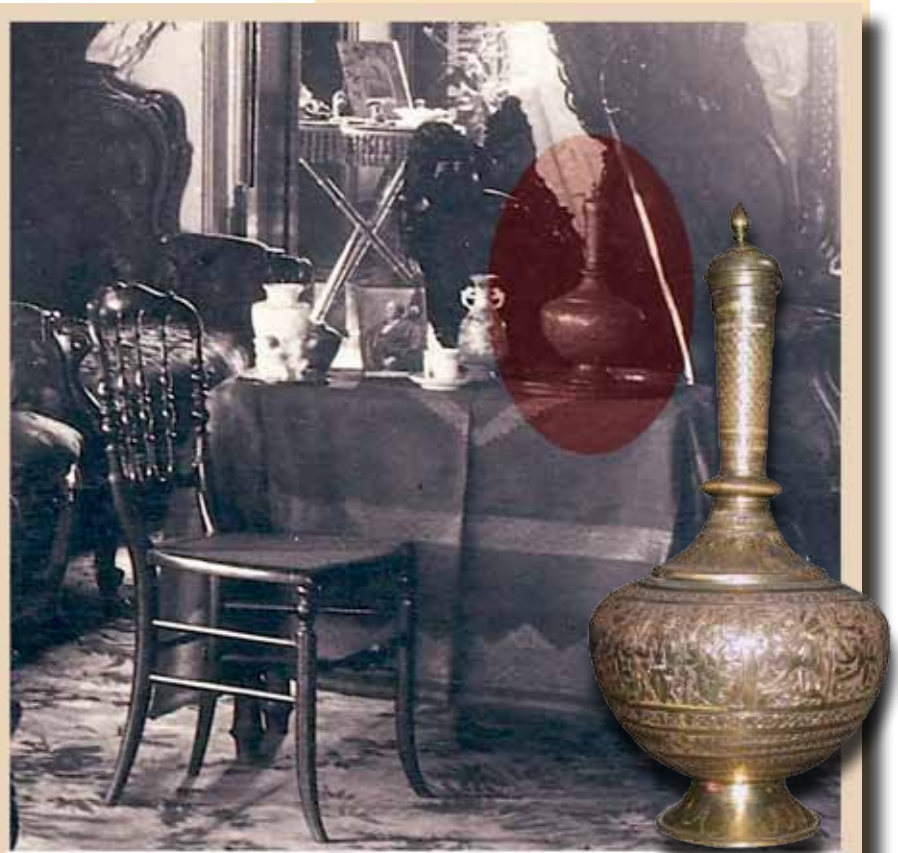
1900 Benares Hand Hammered Brass Water Bottle and Tray XIX Century [383] Circular tray and bottle are chased with allover designs developing flower forms, scrolled leafage, leonine figures, personages and diaper patterns. 20 It is stated by members of the Campbell household that the foregoing tray and bottle were presented by General U. S. Grant to Robert Campbell, father of the deceased.